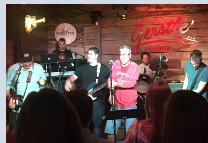
Members of One More Round & Fat Sandwich performing