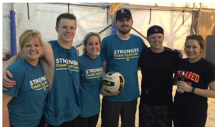
Winner of the first annual Spike Out Sarcoma, Team Radcliff